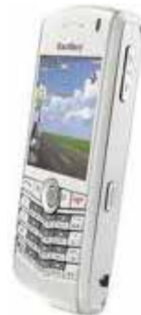
Blackberry Pearl - 199€

phone. The Sony Ericsson Smartphone, for example, offers users both a touch screen and a full QWERTY keyboard. Despite the fact that the manufacturer calls this product a smartphone, the generic term for a PDA oriented device with mobile phone capabilities is called a PDA phone. If your phone is going to be used as a data device, and particularly if you are go-