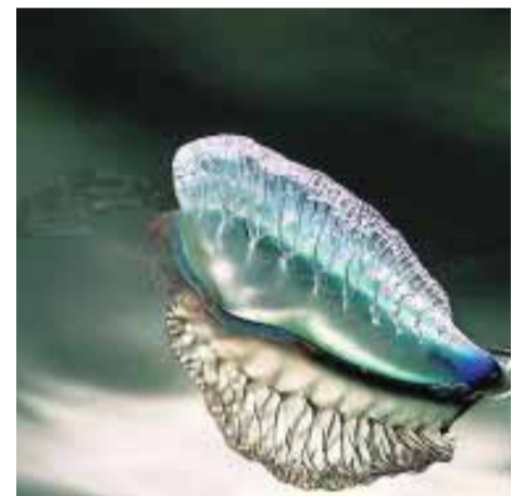
lyfish from the shores.

At the end of May, Benidorm's beaches had to be closed to bathers for a few days whilst council technicians cleared the jellyfish from the shores.