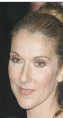
Celine Dion - see Question 8