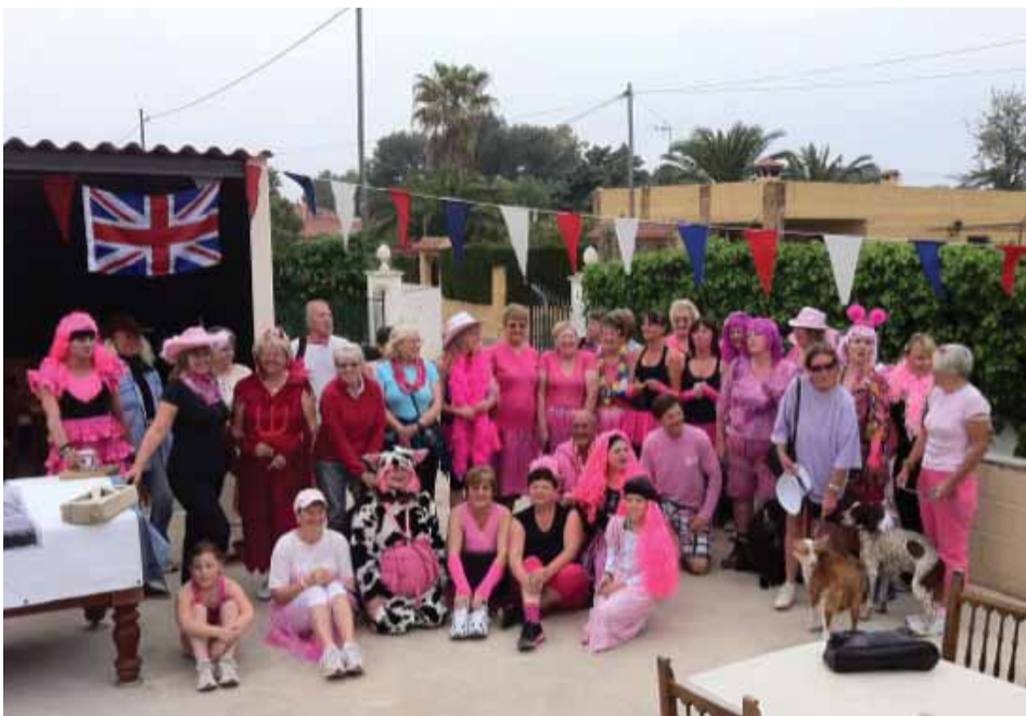
The Magpies Bar Camp de Liria, raised a massive £2000 for Cancer Research UK in their first "Race for Life"

The Magpies Bar Camp de Liria, raised a massive £2000 for Cancer Research UK in their first "Race for Life" event on April 30th which was double their original target.