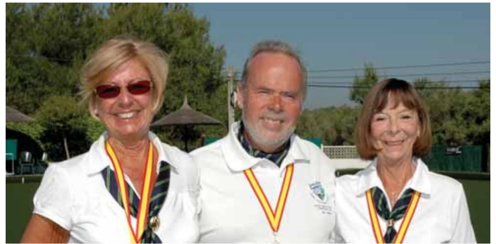
Competition which starts on the 13 June and will be played daily until the final on 18 June.

This will be followed by the Dragon 4.2.2 Club