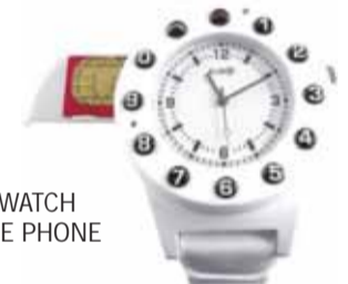
BURG WATCH MOBILE PHONE - 99€

UNLOCKED A Great Gift ! G5 Burg Watch Free Phone Who said clock could not be a mobile phone? The phone-brand watch Burg make it easy to contact quickly with your friends or family