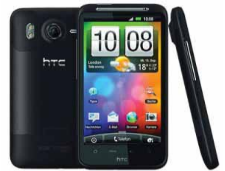
HTC Desire - 420€

A smartphone is considered to be the combination of the traditional PDA and mobile phone, with a bigger focus on the mobile phone part. These handheld devices, integrates mobile phone capabilities with the more common features of a handheld computer or PDA. Smartphones allow users to store information, e-mail, install programs, along with using a mobile phone in one device. A smartphone's features are usually more oriented towards mobile phone options than the PDA-like features. There is no industry standard for what defines a smartphone,